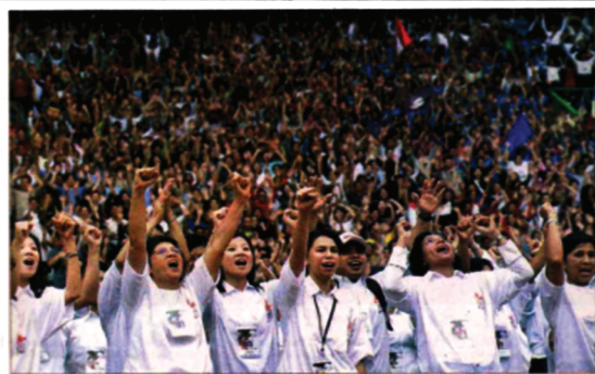
RIISING SPIRIT Christians raise their hands high as they sing songs during a gathering called the National Prayer at Bung Karno Stadium in Senayan, Central Jakarta. Tens of thousands of Christians packed the stadium on Thursday to attend the event held to commemorate the Ascension Day of Jesus Christ.

Friday, May 6, 2005 TWENTY-FOUR PAGES Vol. 23 No. 11